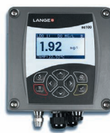
SC 100 Controller Up to two SC probes can be connected

The light source emits a high-intensity beam of light, which strikes the surface of the liquid diagonally. The detector registers the light that is scattered at 90° to the incident beam. This scattered light is proportional to the content of suspended particles in the sample.