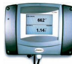
SC 1000 Digital Controller Up to eight SC probes can be connected; can be easily upgraded.